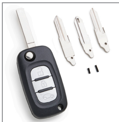
Blades HU136, NE73, VA2 and VAC102 included

Silca is pleased to introduce a new reference for duplicating Renault® remote car keys: the perfect solution for replacing damaged or lost keys, or to have a duplicate in case of emergency.