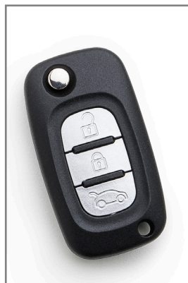
Remote Car Key RNR01